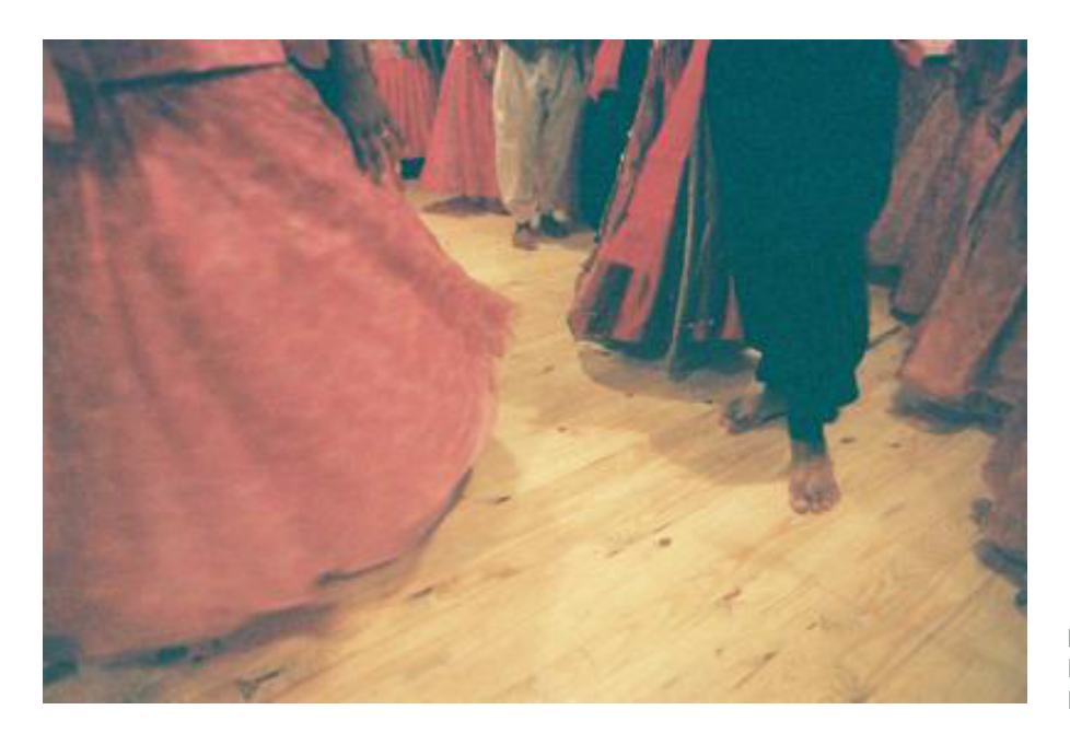
FIGURE 16 Fernanda Rechenberg.

The photographed image also becomes part of a set of symbols embedded in the production of religious meanings and knowledge<sup>35</sup>. Unlike the idea of photography as a dead being, a representation devoid of vividness, the uses and narratives that unfold from the technical image, reframe photography as a "living representation", filled with emotion (Martins 2008, Head 2009). The anthropologist-photographer, therefore, begins to build