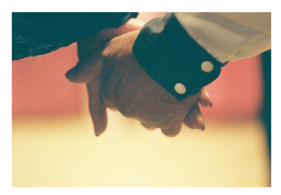
FIGURE 15 Fernanda Rechenberg.