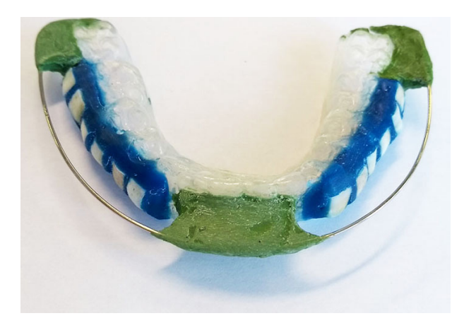
Figure 1- Bauru in situ pellicle model (BISPM)

The AEP samples were prepared for proteomic analysis according to a recently standardized protocol<sup>15</sup>. Briefly, protein extraction was performed twice using a solution containing 6 M urea, 2 M thiourea in 50 mM NH<sub>4</sub>HCO<sub>2</sub> pH 7.8, and the supernatants were stored. To increase protein recovery, the wick papers were transferred to filter tubes (Corning CostarSpin-X Plastic Centrifuge Tube Filters®, SigmaAldrich, New York, New York, USA), centrifuged, and the supernatant was collected. The supernatants were pooled, centrifuged again and transferred to a falcon tube. Then, 50 mM NH<sub>4</sub>HCO<sub>3</sub> were added to dilute the urea and thiourea, and the samples were placed in Falcon Amicon tubes (Amicon Ultra - 15 Centrifugal Filter Units - Merck Millipore®, Tullagreen, County Cork, IE), centrifuged and concentrated to approximately 150 µL. Reduction [5 mM dithiothreitol (DTT) for 40 minutes at 37°C] and alkylation [10 mM iodoacetamide (IAA) in the absence of light for 30 minutes] were performed. Samples were then digested using 2% (w/w) trypsin (Promega<sup>®</sup>, Madison, Wisconsin, USA). Then 10 µL of 5% formic acid was placed to stop the action of trypsin. C18 Spin columns (Thermo Scientific<sup>®</sup>, Rockford, Illinois, USA) were used to desalt and purify the samples, and protein was quantified using the Bradford method (Bio-Rad®, Hercules, Califórnia, USA). The amount of