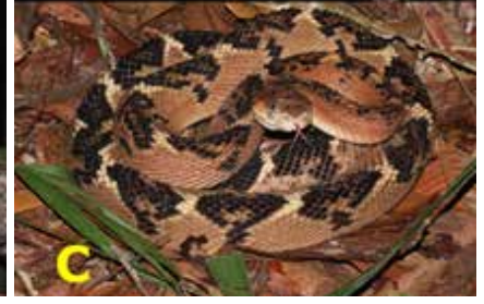
Figure 2: Some venomous snakes from the region: A) Jararaca ( Bothrops atrox ); B) Papagaia (B. bilineatus ); C) Surucucu-pico-de-jaca ( Lachesis muta ).

and 2013 and 2012, both with 11 cases. No deaths were recorded during the study period. Accidents were more frequent in rural area (87.5%) and most cases occurred