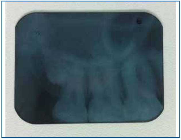
Figure 2: Periapical radiography of the region before the extraction of tooth 28 and the fourth molar.