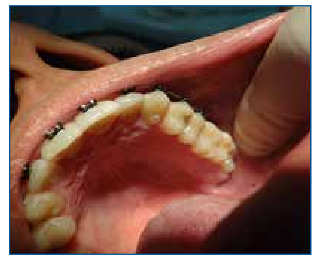
Figure 3: View of the area just before extraction of tooth 28 and the supernumerary upper-left fourth molar.