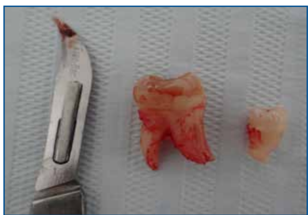
Figure 5: Tooth 28 and the fourth molar after surgery.