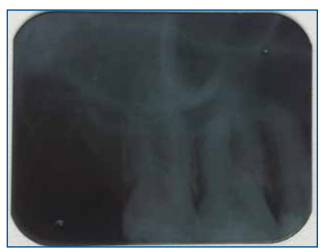
Figure 6: Periapical radiography of the region seven days after the surgery, for purpose of follow up.

Post-surgical follow up was performed 7, 15 and 30 days after tooth extraction. The patient showed a positive evolution, without complications.