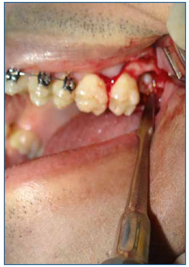
Figure 4: Showing the fourth molar during the excision.

Cefalexin 500 mg, 1 tablet, oral administration, 6/6 h \times 7 days; diclofenac sodium 100 mg, 1 tablet, oral administration 8/8 h \times 3 days; dipyrone, 35 drops, oral administration, 6/6 h, as necessary; chlorhexidine gluconate 0.12%, rinse three times daily \times 7 days<sup>14</sup>.