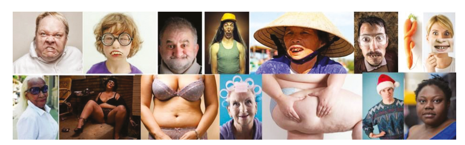
Figure 7 Ugliness is male, associated with faces, malformations, body fat and aging

In the racial context, the difference between images that represent white bodies as results for the keyword ugliness and non-white bodies, especially blacks, is incisive. To the white body, one perceives that the images inscribe a necessary submission to the sign of ugliness that is external to it. The face, the glasses, the out-of-fashion objects etc. would represent this ugliness that must be coupled, linked, instilled in a subject that is not ugly (Figure 7). Black people in the images in this case, on the contrary, do not make use of these artifices to be considered relevant to ugliness, in the algorithmization of contemporary racism (Figure 8). In the "persistence of the colonial mentality" (Araújo, 2000, p. 33), ugliness is a constitutive part of the black body and belongs to it without the need for great efforts.