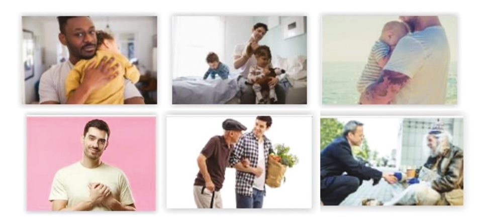
Figure 4 \label{eq:Figure 4} The kindness/affection of men is hardly addressed to women

Still in the gender context, it is interesting to note that the few men who appear as agents of kindness, whether in the sense of goodness/gentleness or in the sense of affection, almost never have women as the target. That is, men hardly ever appear to be kind to women, but are kind to the elderly, children or other men (see figure 4). Considering that the results are opposite in the context of aggressiveness (in which men appear predominantly as agents of aggression against women), it is evident that this difference contributes to the definitions of affections that men seem to be able and duty to address to women in contemporary culture.