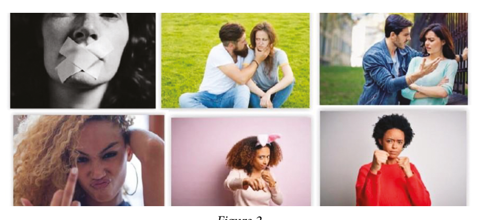
Figure 2 Whereas white women are victims, black women are agents of aggressiveness

(Figure 2). Yet again, the image banks seem to reinforce the stereotypes of white female fragility and black female strength/aggressiveness, emphasizing, in their algorithmic formulas, the different experiences of gender oppression and the different points of view "about what it is like to be a woman in an unequal, racist and sexist society" (Bairros, 1995, p. 461).