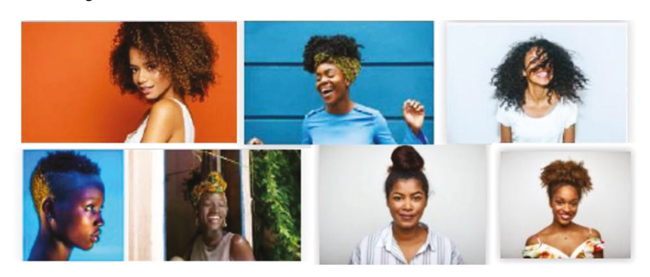
\label{eq:Figure 6} Figure \ 6 Black women are few and positioned differently from white women \it Sources. Shutterstock and Getty Images.

The few black women (less than 10%) that are presented by these search engine algorithms as relevant results for the keyword beauty are not positioned in the same way as white women (Figure 6). In fact, they are not attributed to this delicate and fragile touch common to white women, but to a strong, confident and stripped down posture. Black women manifest a more confident and adult sexuality. Therefore, there is a strengthening of patterns of feminine existence, under the cut of race, as already pointed out by Sueli Carneiro (2003, p. 1): "When we speak of the myth of feminine fragility, which historically justified the paternalistic protection of men over women, which women are we talking about"?