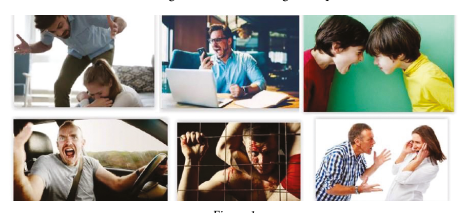
Figure 1 Men and boys are the majority result as agents of aggressiveness

In this investigation, no distinctions were made between children and adults, since this study aimed at understanding which bodies and subjects are associated with the constructs of aggressiveness and kindness around gender and race. Although "aggressiveness is constitutive of the subject" (Da Silva, 2004, p. 73), the imaginary of violent masculinity and feminine delicacy is constructed since childhood, corroborated by the images put into circulation. There is, therefore, a bodily learning of masculinity, "cultivated by a complex process of masculinization, starting in early childhood" (Felipe, 2000, p. 123), which associates the aggressive force to men. Thus, images serve boys and girls as sources for understanding the limits of their gender performance.