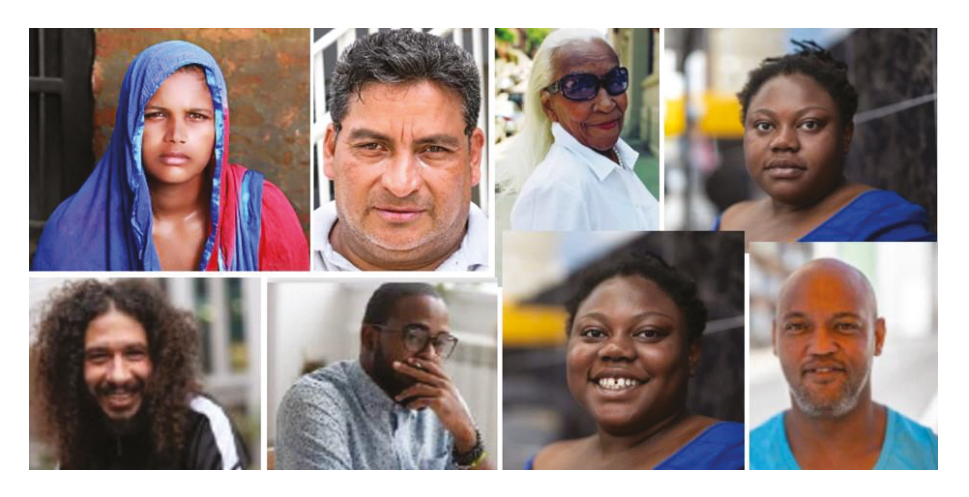
Figure 8 Images of black people as relevant to ugliness without explicit association of any sign of lack of beauty

In the racial context, the difference between images that represent white bodies as results for the keyword ugliness and non-white bodies, especially blacks, is incisive. To the white body, one perceives that the images inscribe a necessary submission to the sign of ugliness that is external to it. The face, the glasses, the out-of-fashion objects etc. would represent this ugliness that must be coupled, linked, instilled in a subject that is not ugly (Figure 7). Black people in the images in this case, on the contrary, do not make use of these artifices to be considered relevant to ugliness, in the algorithmization of contemporary racism (Figure 8). In the "persistence of the colonial mentality" (Araújo, 2000, p. 33), ugliness is a constitutive part of the black body and belongs to it without the need for great efforts.