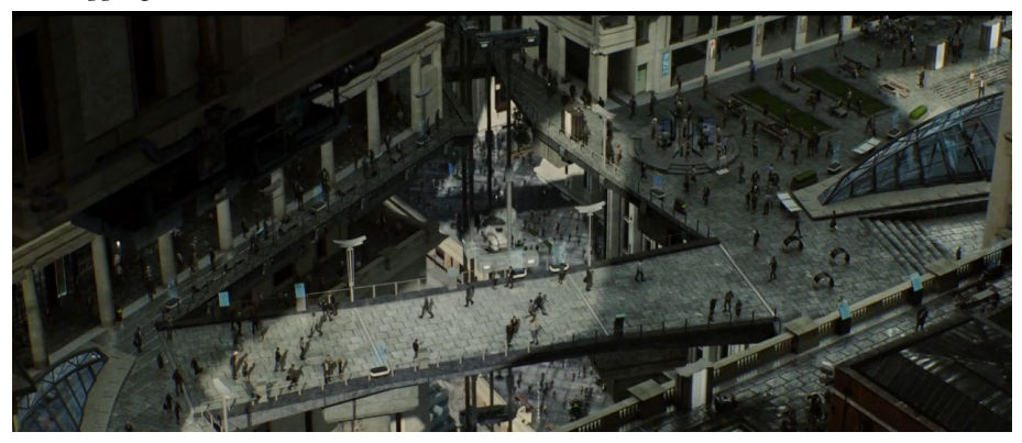
Figure 8 Overlapping streets in London

Note. Screenshot from the movie Total Recall. (Time code: 59'24")