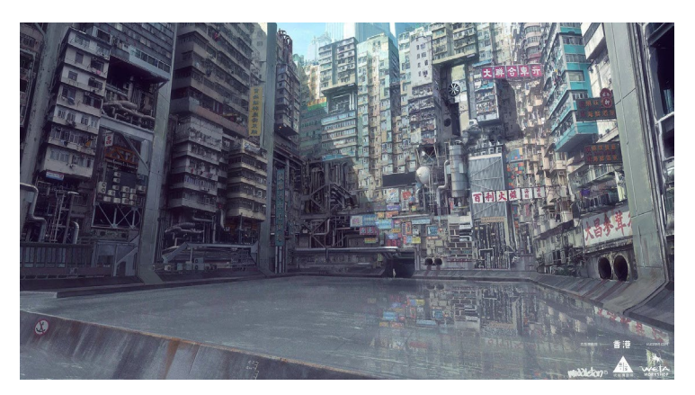
Figure 4 Outskirts of New Port City