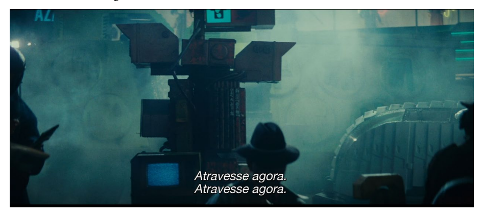
Figura 2 Downtown Los Angeles

Note. Screenshot from the movie Blade Runner. (Time code: 56'49")