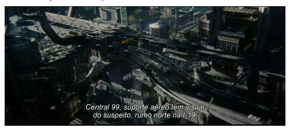
Figure 7 London, end of the 21st century

Note. Screenshot from the movie Total Recall. (Time code: 53'24").