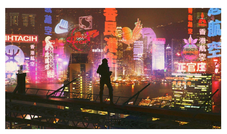
Figure 3 New Port City, 2029

Note. https://www.behance.net/gallery/51424063/GHOST-IN-THE-SHELL