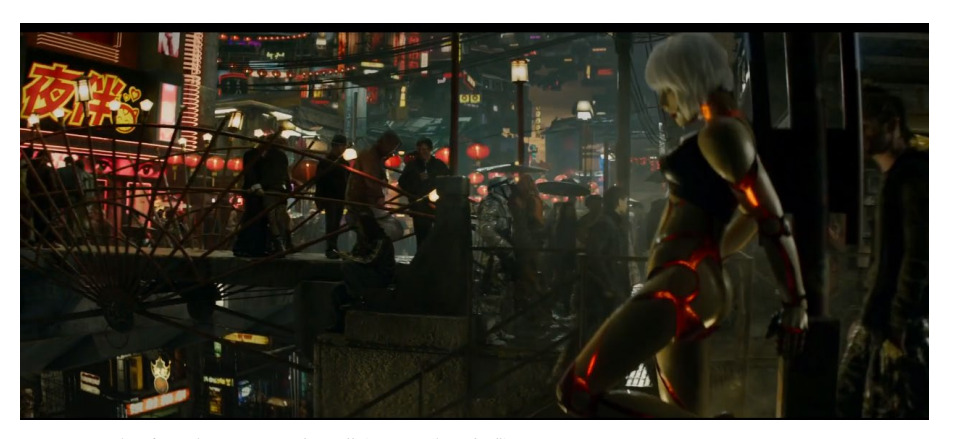
Figure 6 Downtown Colony

Note. Screenshot from the movie Total Recall. (Time code: 32'40")