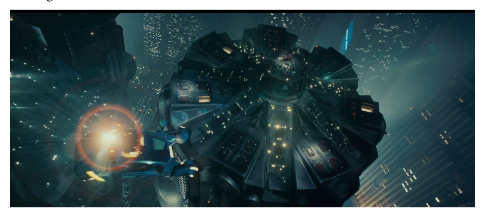
Figure 1 Los Angeles, EUA, November 2019.

Note. Screenshot from the movie Blade Runner. (Time code: 10'45")