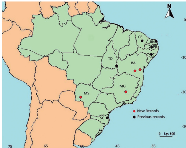
Figure 2. Map of Brazil showing the previously known records (black dots) and the new records (red dots) of Helicina schereri . Abbreviations of the neighboring states: AL = Alagoas; BA = Bahia; CE = Ceará; MG = Minas Gerais; MS = Mato Grosso do Sul; RN = Rio Grande do Norte; SC = Santa Catarina; TO = Tocantins.

Abbreviations: Shell measurements: D = shell diameter; H = shell height; w = aperture width; h = aperture height.