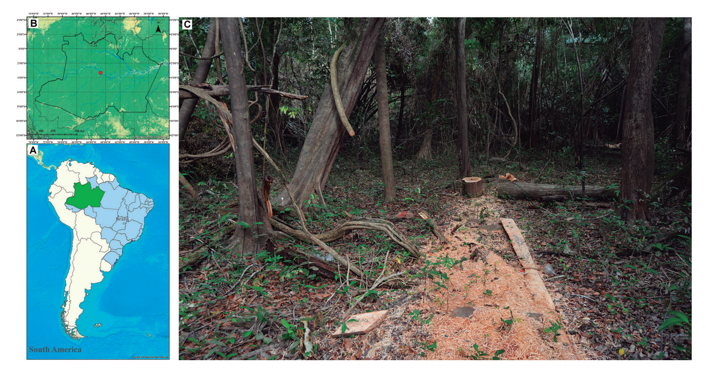
Figure 1. Location where the observations occurred. (A) South American with Amazonia state (Brazil) marked; (B) Amazonia state with the location of observation in Tefé municipality marked (red point); (C) area of observation.

The species Luehea cymulosa is widely distributed in Amazon region and we believe that it is possibly another host plant of M. angulate . Although no hatching of M. an gulata has been observed, the large number of M. angulata mates on a vine attached to L. cymulosa and the Amazonian distribution of this tree underlies this argument.