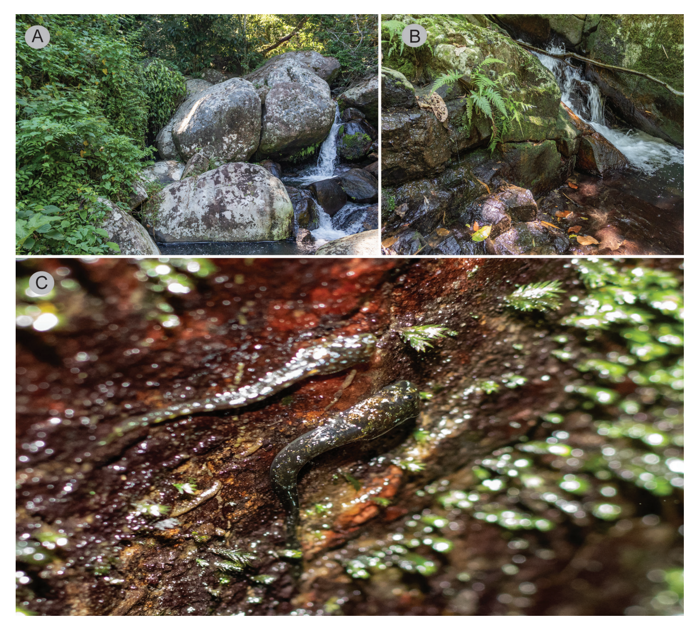
Figure 3. Aspect of the river on the beach of Longa, at Ilha Grande, Angra dos Reis, Rio de Janeiro. (A) An overview of the macrohabitat, (B) detail of the mesohabitat, and (C) close up of microhabitat were tadpoles of Cycloramphus boraceiensis are found.

bilobed in the latter two. The absence of gap on P1 in C. fuliginosus, C. lutzorum and C. rhyakonastes distinguishes these three tadpoles from C. boraceiensis. The tadpole of C. izecksoni differs by the relative position of the nares, which are closer to eyes. In C. bandeirensis the nares are instead closer to snout. Cycloramphus boraceiensis differs from C. valae by its eye diameter, which is proportionally (relative to body length) larger than in C. boraceiensis (although we did not take into consideration stages of development). Lastly, C. stejnegeri has the most distinctive tadpole from C. boraceiensis. Tadpoles of C. stejnegeri have a reduced and bilobed abdominal flap, in addition to differences in larval mouthparts (papillae and keratodonts); LTRF 2(1,2)/2(1) and the spiracle is absent (but see discussion). We refrain from using morphometrics for diagnostic comparisons because, properly done, this would require data from across developmental stages to estimate comparative allometric curves, and collecting such data was not possible due to the small sample size.