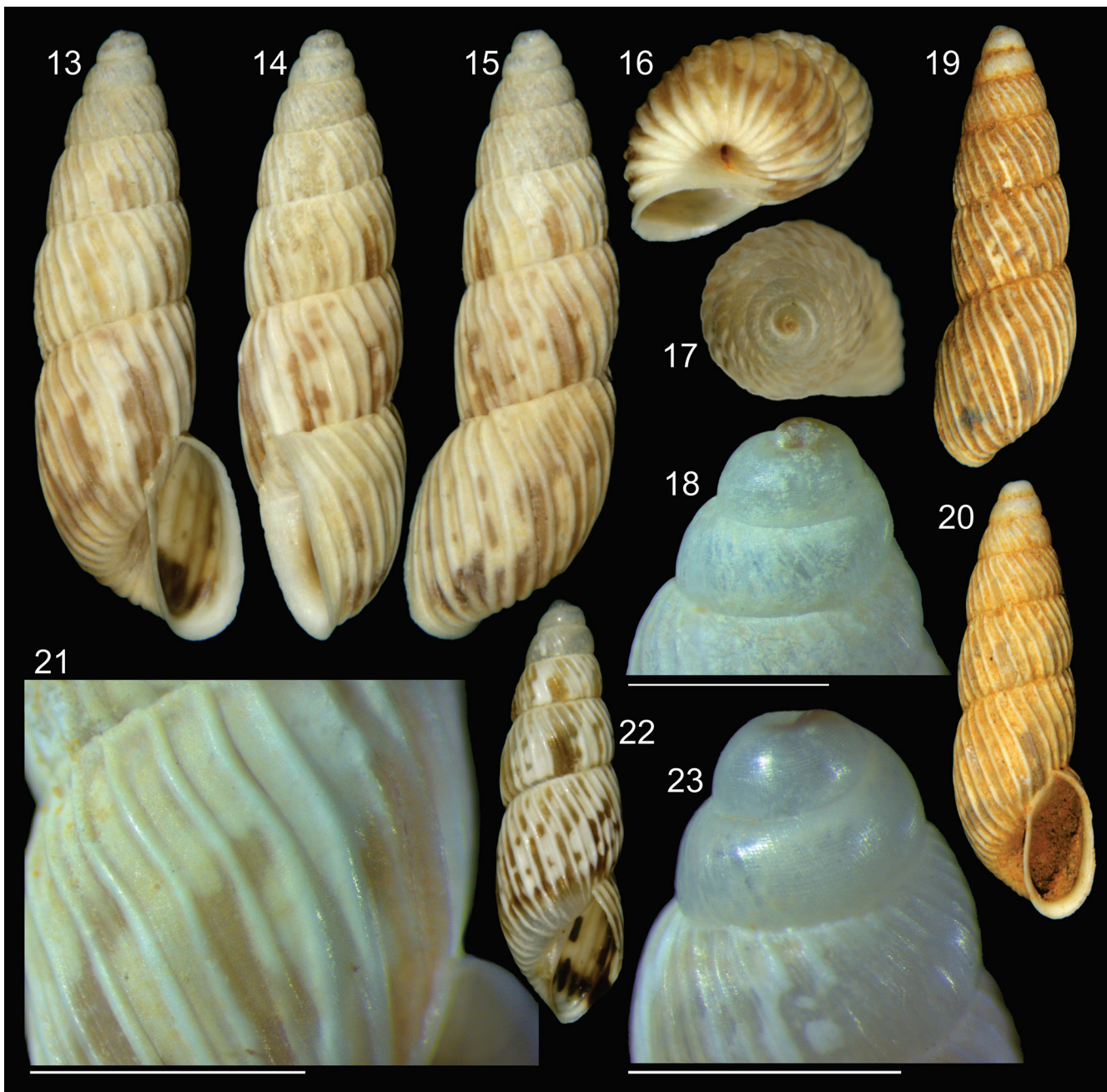
Figures 13-23. Stapafurdus costiferus sp. nov. , shell of types. (13-17) Holotype MZSP 154046 (L 12.0 mm). (13) frontal view. (14) right view. (15) dorsal view. (16) inferior-slightly left view. (17) apical view. (18) protoconch and first teleoconch, profile, scale = 1 mm. (19-20) Paratype MZSP 153882#1 (L 11.1 mm): dorsal and frontal views. (21) holotype, detail of sculpture of penultimate whorl, scale = 1 mm. (22-23) paratype MZSP 153882#3 (L 9.8 mm). (22) frontal view. (23) protoconch and first teleoconch, profile, scale = 1 mm.

The last whorl of Stapafurdus gen. nov. , having an umbilicus and antero-posteriorly elongated peristome, is similar to Anctus Martens, 1860 (Simone, 2006: 173), considered a bulimulid or orthalicid, but it differs by the elongated spire and outline, and pale protoconch, as Anctus has obese shell, with dark, not-sculptured protoconch. Elongated peristomes are also found in some species of Moricandia Pilsbry & Vanatta, 1898 (Simone, 2006: 171-172), odontostomid, from which Stapafurdus