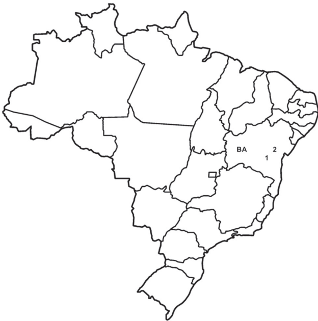
Figure 30. Map of Brazil with states outlined. Bahia indicated by "BA", with indication of places of occurrence of Stapafurdus glaber sp. nov. (1 = Ituaçu) and of S. costiferus sp. nov. (2 = Ubitaitá).