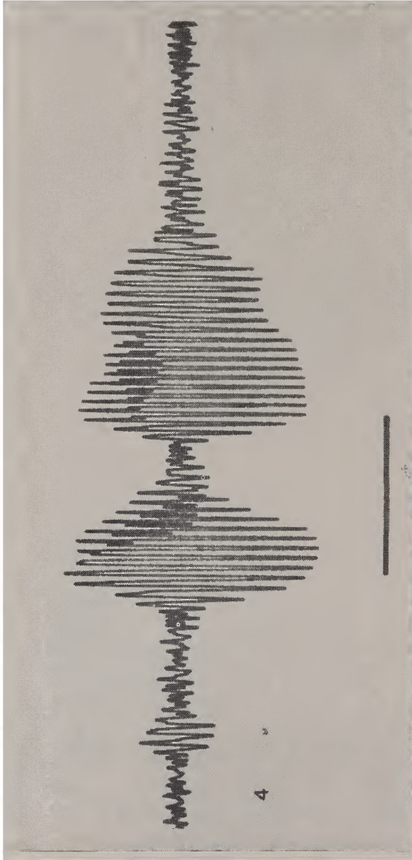
Fig. 4. Strip chart recording of mating call of Physelaphryne miriamae . Line indicates 0.01 second. Recording data same as for Fig. 3.