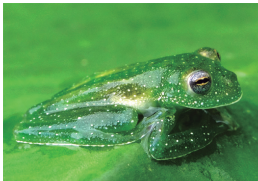
Figure 2. An adult male Centrolene solitaria (ICN 55740) from Caquetá, Colombia.