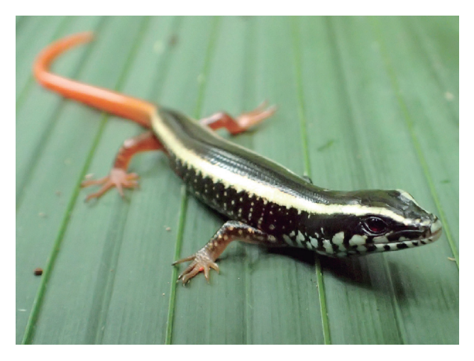
Figure 1. Juvenile Diploglossus scansorius (CM 163365) in life.

Color in life is shown in Figure 1. The color after 13 months in preservative is, as follows: middorsal surfaces dark grayish-brown, with a pair of well-defined, pale bluish gray dorsolateral stripes originating on the first pair of internasals and extending onto the tail, where they fade and blend into the yellow-orange tail coloration; upper 50-90% of most supralabials dark gray-brown, irregularly bordered with pale cream towards lower edges, with a darker gray border along posterior edges of each scale; supralabials 7 and 8 almost completely cream colored, with dark gray surrounding intervening sutures; lateral surfaces dark gray-brown, slightly lighter than middorsum, with scattered pale bluish-gray spots becoming more abundant ventrally and anteriorly, appearing most profuse anterior of forelimbs and adjacent to ventral coloration; infralabials 25-50% dark gray on white ground color and dark pigment centered around sutures between scales; ventral coloration immaculate cream-white; limbs brownish-gray along most dorsal portions, mottled laterally, and vellowish-white ventrally; ventral surfaces of hind limbs somewhat darker yellow than forelimbs, intermediate in color to forelimbs and tail; middorsal and lateral dark coloration extending onto tail forming a tapered grayish middorsal stripe and shorter midlateral stripes.