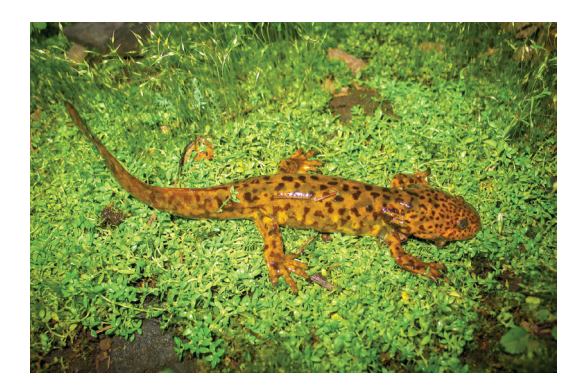
Figure 1. A subadult Ambystoma altamirani from Sierra del Ajusco, México City, Mexico, illustrating the species color pattern.

We established 25 permanent sites, each 5 m long and 40 m apart, along the Arroyo los Axolotes using a mobile GPS unit. We visited the Arroyo los Axolotes multiple times per month (range: 1–10) from February 2018 to January 2019. Visits took place between 11:00 and 15:00 h. when we visually searched the permanent sites along the stream for A. altamirani; we spent about 10 min per site, and used a herpetological hook along the bottom and