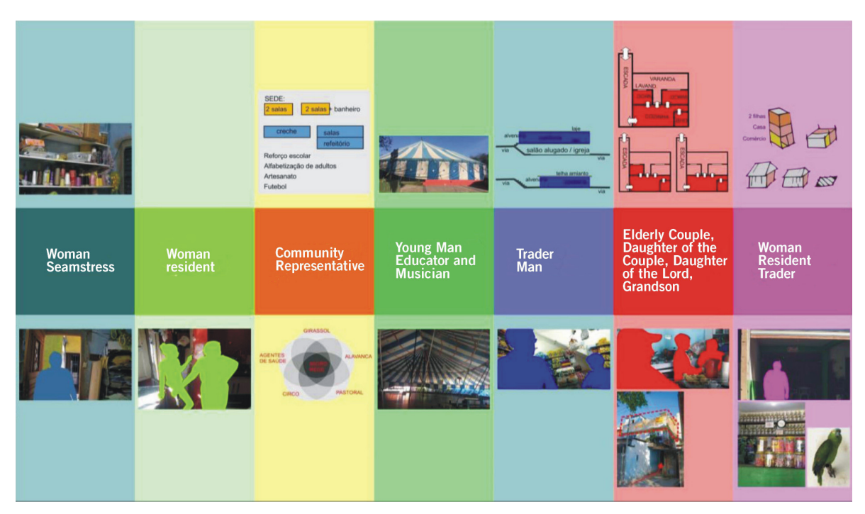
Figures 6 and 7 – Synthetic cartographies of the studied actors of the São Remo slum, a temporal and spatial reading