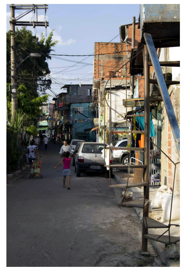
Figure 2 – Photo of São Remo slum. At the top of the image is the University City.

<sup>4</sup>The"Program Avizinhar", established in 1998, aims to create a respectful coexistence between USP and the population next to campus . The Program operates in educational activities, family, school and community support and cooperation networks.