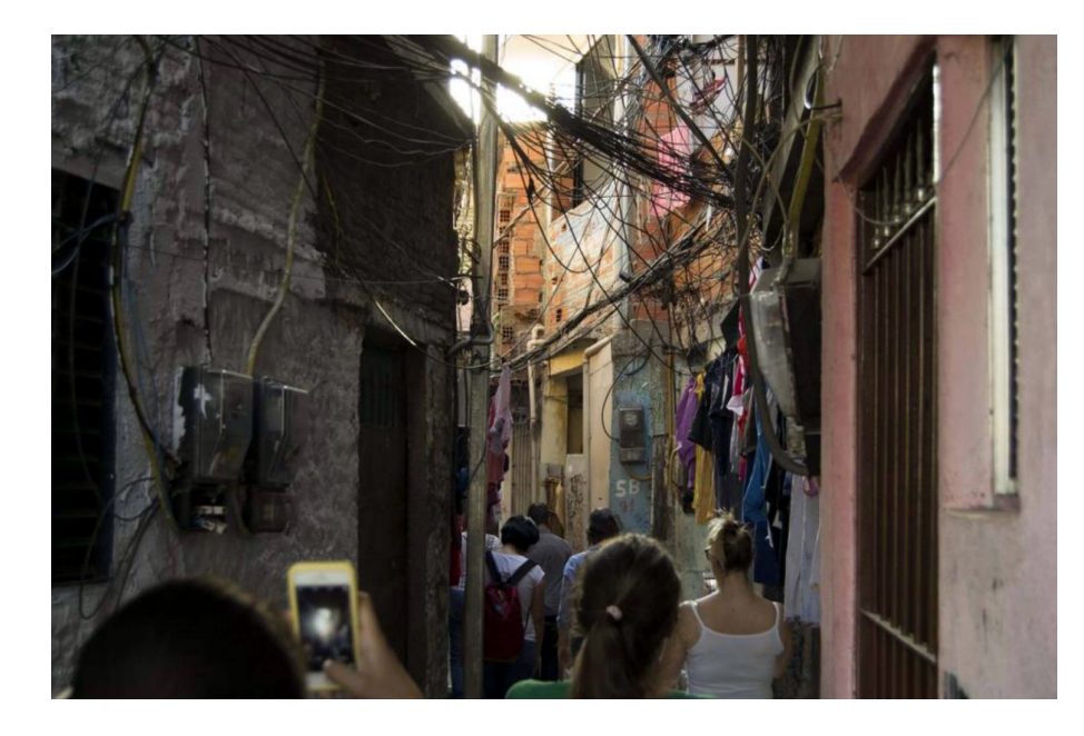
Figure 1 – Walk through the São Remo slum, 2017

To undertake walks as scientific experiments, we also resorted to the studies of Italian architect Francesco Careri (2013) on the aesthetic practice of walking. His work has pointed to drift as a tool for knowledge and transformation of the crossed space, placing the landscape as a means in which human existence is verified, recorded and invented. Experiencing the drift of a place, overcoming the purely sensitive moment, we move from memory to the report in a translation procedure. Thus, it is presented as perception and representation of spaces the very being in the world and, fundamentally, points of view about things, ideas.