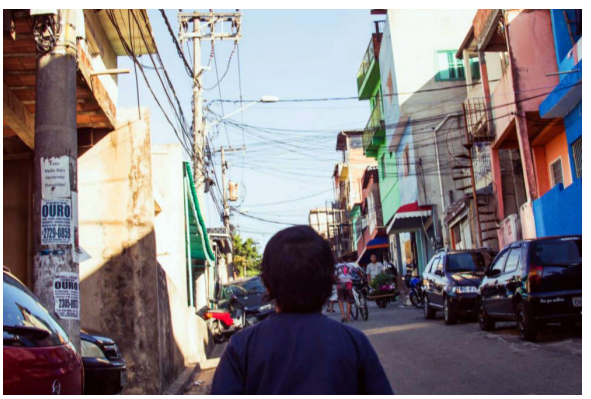
Figure 4 – One of the guide boys in the activity of knowing São Remo

The first approaches were made with the Alavanca Institute group of students in a mutual recognition workshop, where students from USP and Alavanca mapped locations from aerial photography. This activity played an important role in initiating bonds between students and researchers, but also in recognizing links with the place. As they scanned the map with their eyes and fingers, all involved were building a universe of affective points in the territory of the São Remo slum.