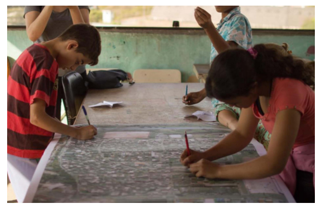
Figure 3 – Unraveling the map of São Remo Source: collection of images of the discipline. Photo: Elisabeth Orthon, 2017.