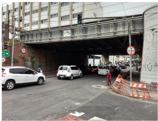
Figure 8 – Pedestrian faces cars under rails. The difficult transposition of the railway in Bom Retiro, together with the priority for cars, is an example of the barriers arising from the transport system.

death rate of approximately 6 people per 100,000 inhabitants, almost twice as much as New York, for example (MALATESTA, 2015).