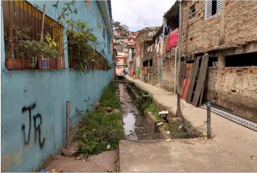
Figure 3 – Sidewalk in Jardim Damasceno that demonstrates one of the many difficulties faced by pedestrians who live on the outskirts of São Paulo. Photo: author (personal file), 2018.