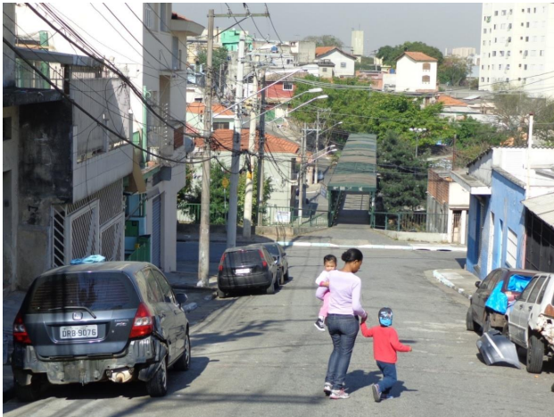
Figure 7 – The uninviting scenario in the scene of the woman crossing the street with two children in Sacomã. Photo: author (personal file), 2018.