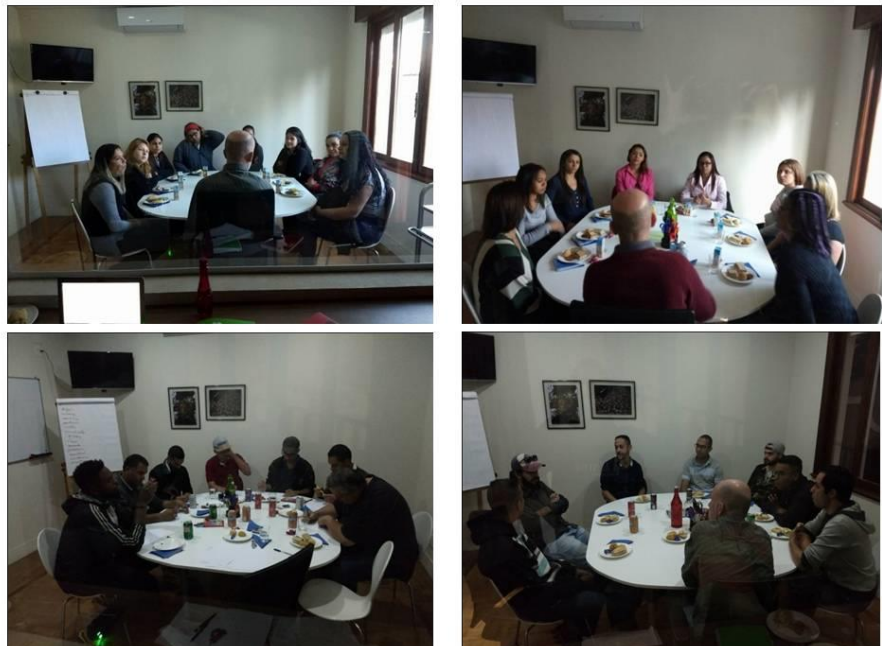
Figure 1 – (a) Women living in peripheral neighborhoods. (b) Women living in central neighborhoods. (c) Men living in peripheral neighborhoods. (d) Men living in central neighborhoods. Photo: author (personal file), 2018.

Moderation: José Roberto Labinas Oliveira, professional focus group moderator for several research companies over the last fifteen years, conducted the group discussions. His participation in the project was voluntary.