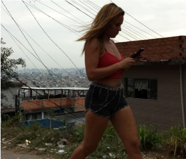
Figure 5 – A woman walking in the Parada de Taipas neighborhood, illustrates the urban landscape on the outskirts of the city.

is a greater risk of violence, assault and harassment, which seems to be intensified by poor lighting in the neighborhoods (Figure 5).