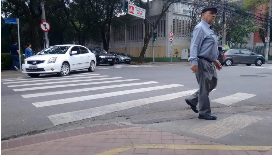
Figure 2 – Pedestrian at pedestrian crossing, west of São Paulo. The decision to walk considers several aspects such as practicality, economy and comfort.

Script: The script served as the basis for conducting the focus groups, with some dynamics to encourage participation. Initially, the moderator presented the research objectives, encouraged individual participation and informed participants that the meeting would be recorded, but protected by confidentiality. After the presentation of each of the participants (name, marital status, hobbies), the participants made spontaneous associations about walking in São Paulo.