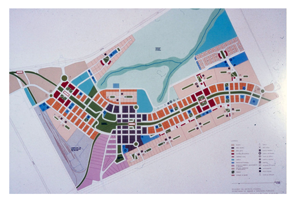
Figure 5: Excerpt from the presentation "Águas Claras Project: an urban planning exercise in the Federal District - 1991" and excerpt from the project and representation of the Águas Claras Project Occupation Plan. 1991. Source: Illustrations provided by Urban Architect Paulo Zimbres. Author's personal file.

Figure 6: excerpt from the presentation "Águas Claras Project: an urban planning exercise in the Federal District - 1991" with representation of the Águas Claras Project Occupation Plan. 1991. Source: Illustrations provided by Urban Architect Paulo Zimbres. Author's personal file.