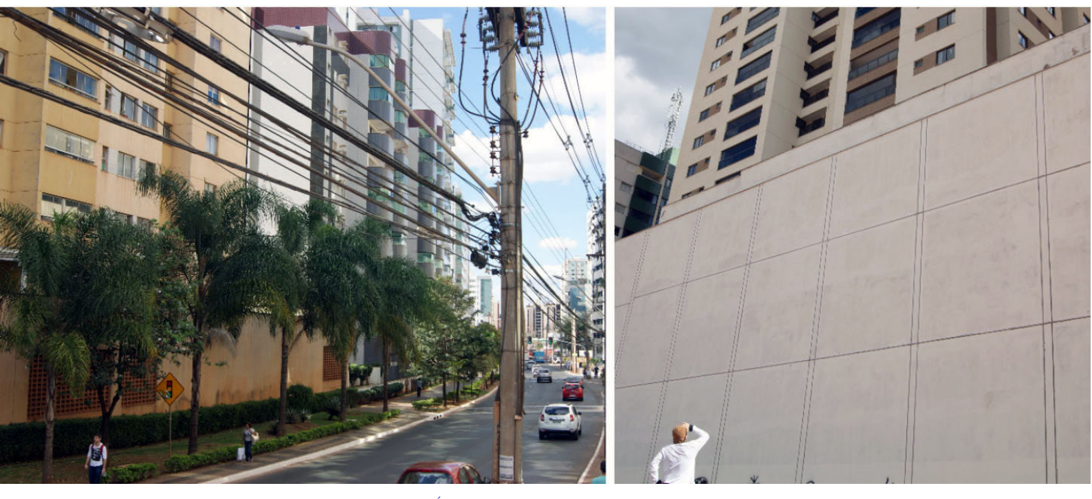
Figure 9: Photographs of a mix of streets and avenues in Águas Claras showing a profusion of occurrences of windowless façades.

another possibility facilitated by legislation. Neither is considered for the purpose of accounting for the occupancy rate and, due to a widespread local demand for security and control instruments and artifacts fueled by a daily fear policy, they have become common items (PEREIRA, 2016).