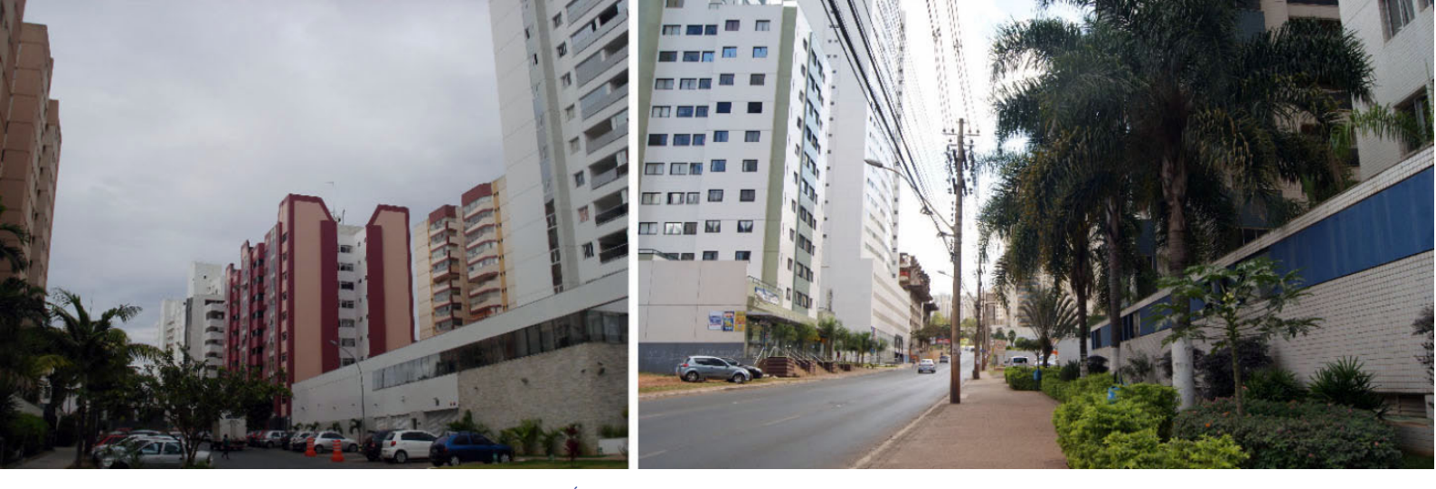
Figure 8: Photographs of a mix of streets and avenues in Águas Claras showing a profusion of occurrences of windowless façades.