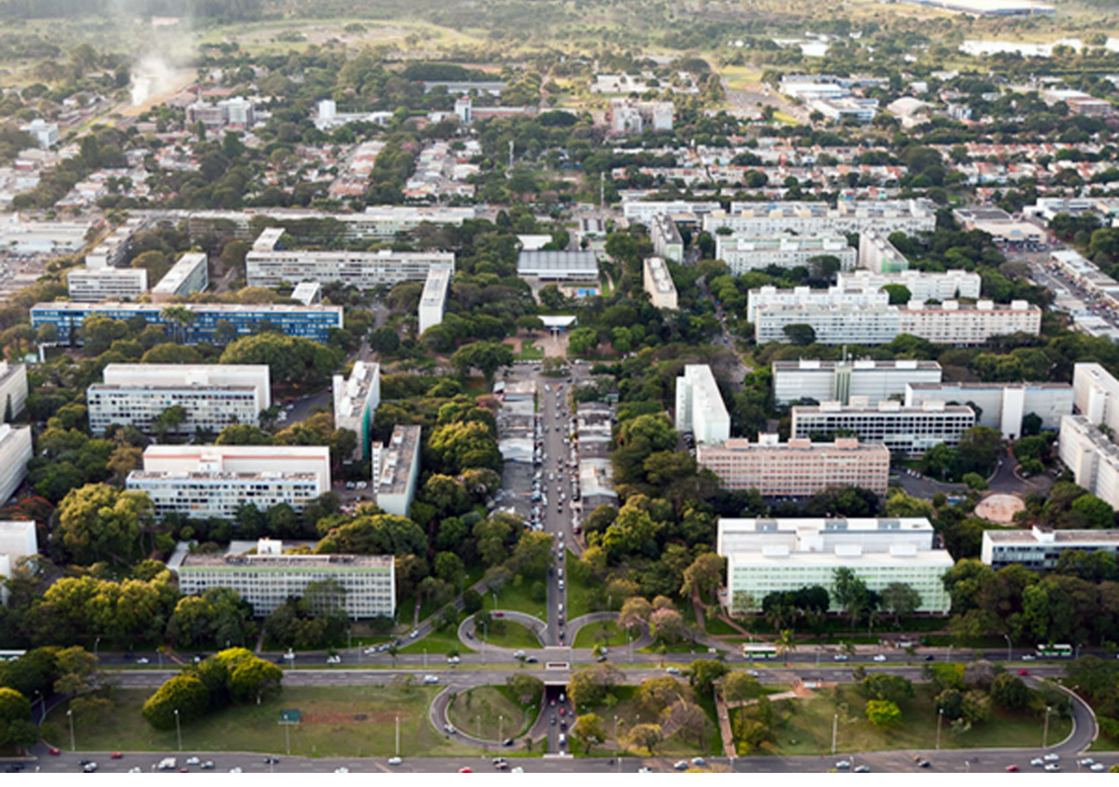
Figure 1: Aerial view of two Superblocks and a commercial area in the Pilot Plan of Brasilia.

2009), in the 1980s became one of its most criticized components (BICCA 1985, HOLANDA 1985a, 1985b, HOLSTON 1993[1989]). Consequently, it would be an urban characteristic to be overcome.