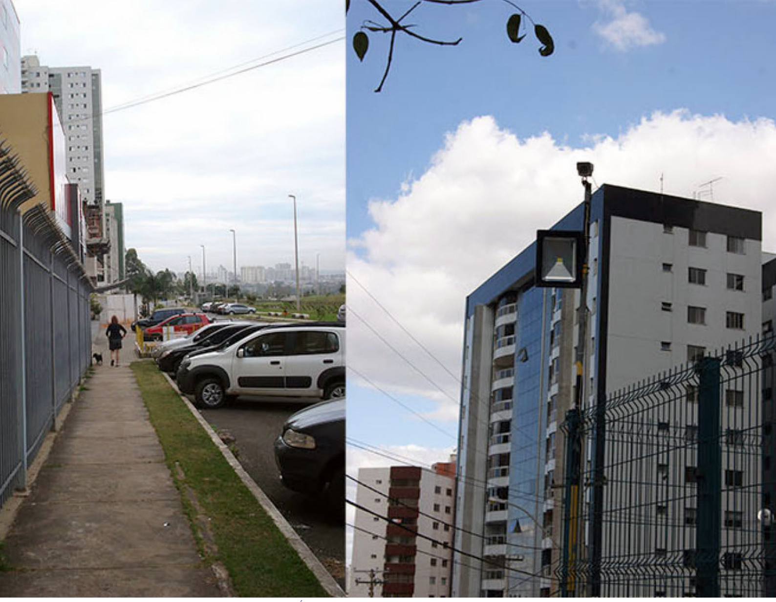
Figure 10: photographs of a mix of streets and avenues in Águas Claras showing a series of bars and security devices that line the public sidewalk.

in local public spaces, existing at a distance of a few meters from the residential complexes. It is a specific way of life, a particular urban conformation.