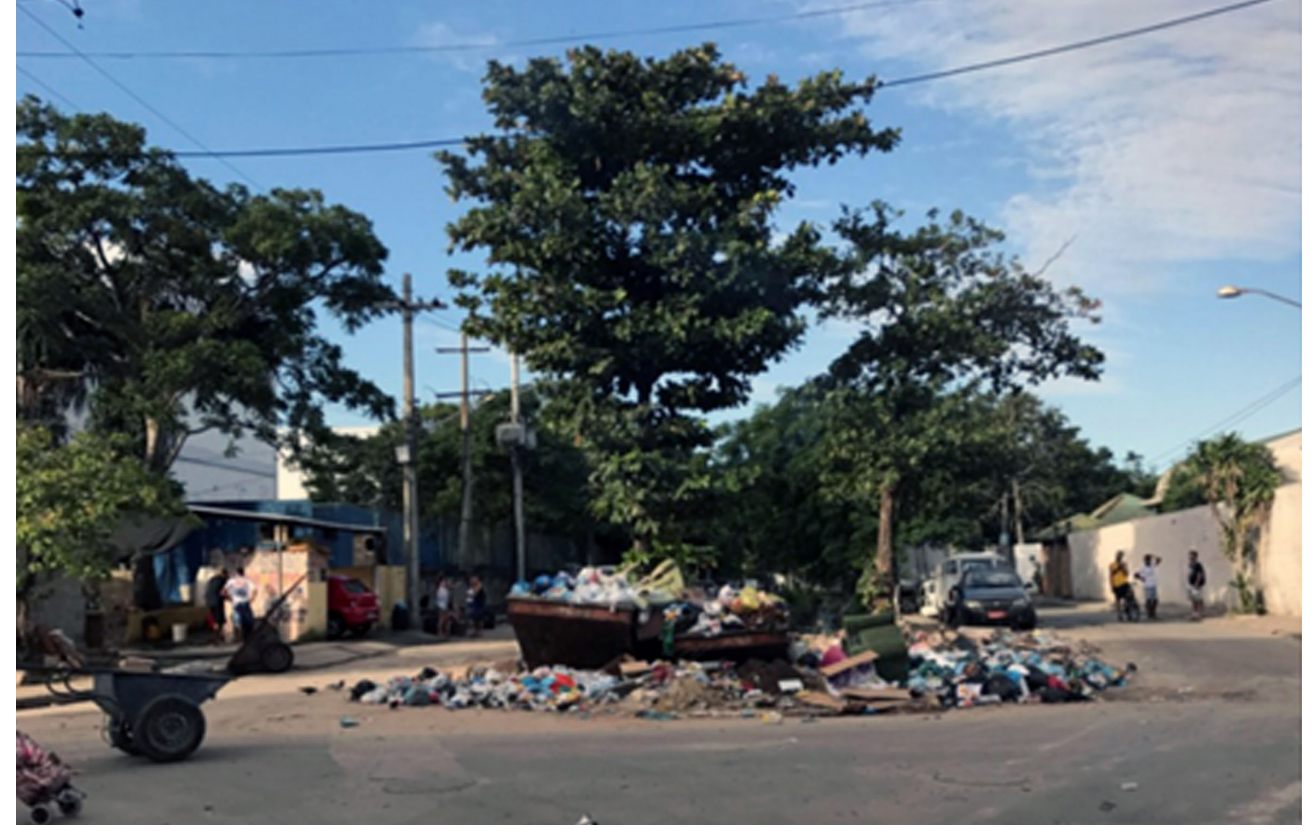
Figure 2: Garbage deposit prior to the intervention.