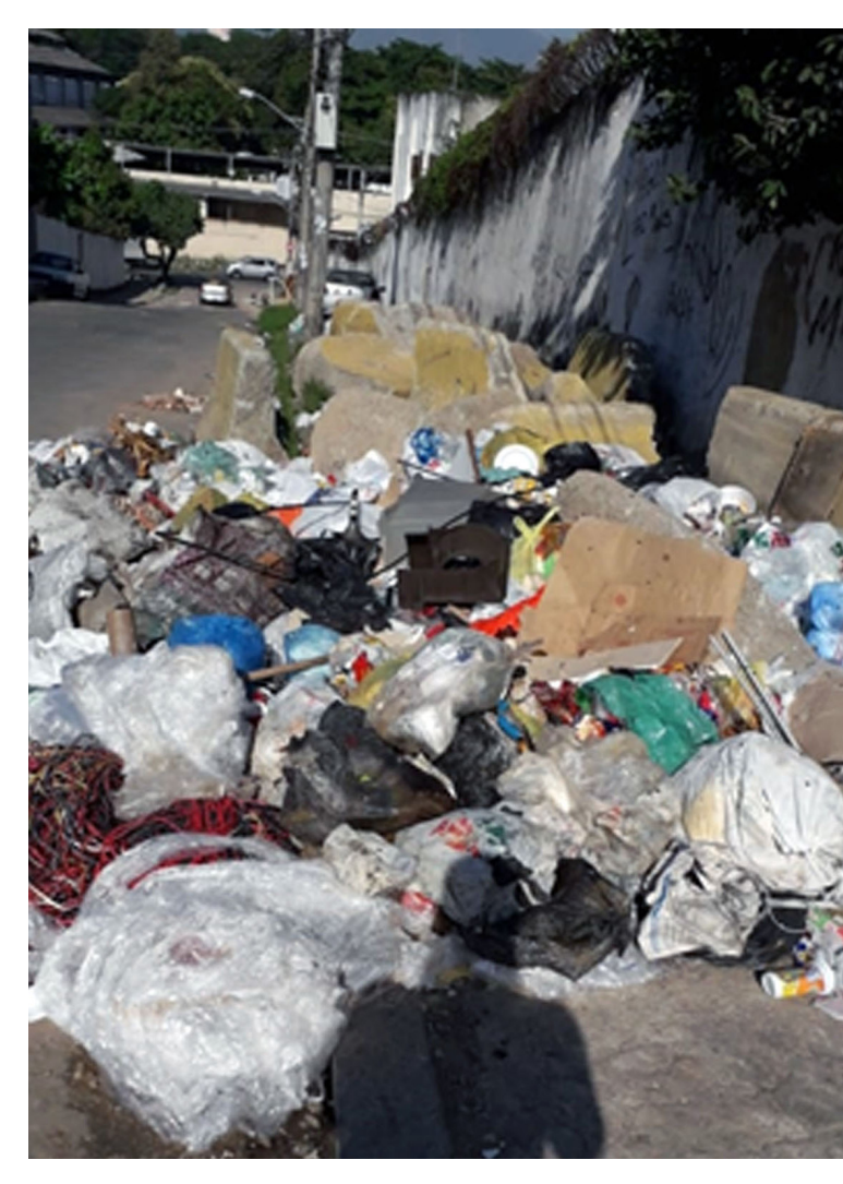
Figures 4 and 5: Before the intervention: Capitão Carlos Street and the sidewalk where the garbage was deposited.