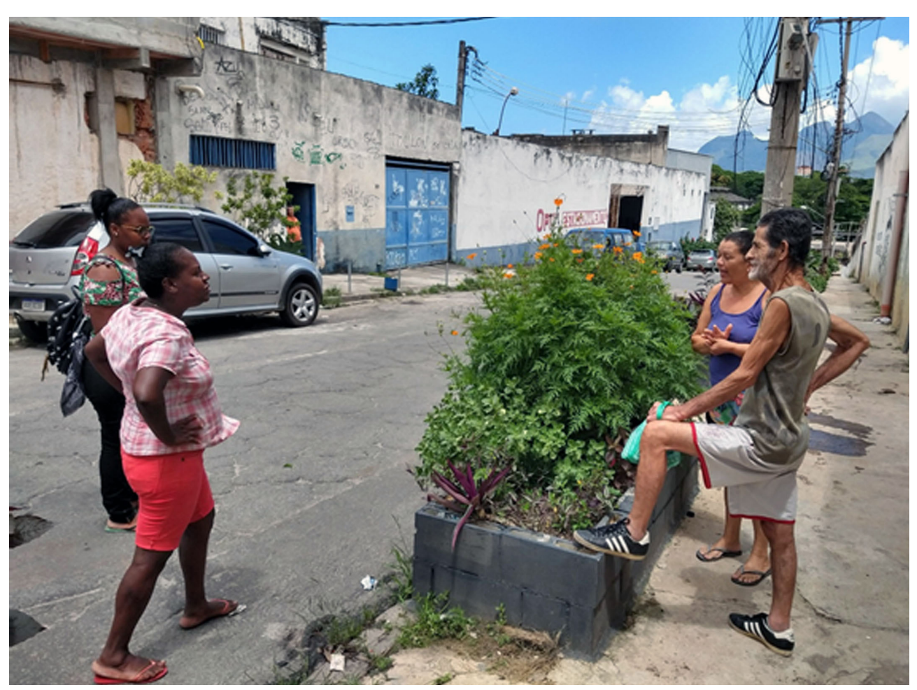
Figure 8: Residents gathered around one of the flowerbeds.

According to Jacobs (2011), unique uses of large proportions in cities, such as very wide walled blocks, create borders, generally seen as "passive" or "limits", characterized by the decay. Certain borders restrict use by allowing circulation only on one side, such as walls. These borders, which can also be seen as residual spaces – the "terrains vagues" (SOLA-MORALES, 1995) – are a direct consequence of the urban changes that the metropolitan territories have been undergoing when moving from an industrial to a post-industrial city (LEITE, 2012).