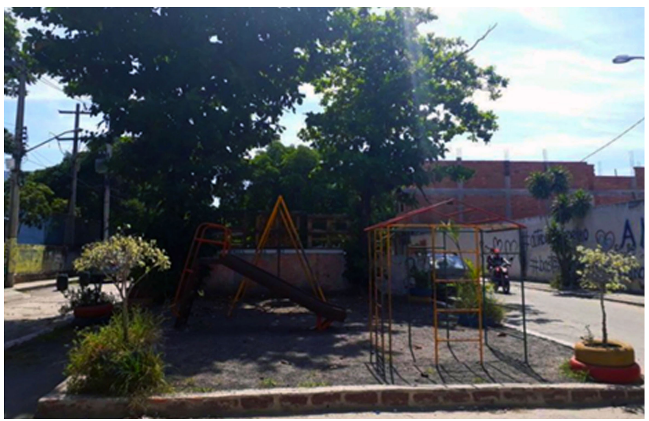
Figure 3: Revitalized square, named as Praça da Paz (Peace Square).