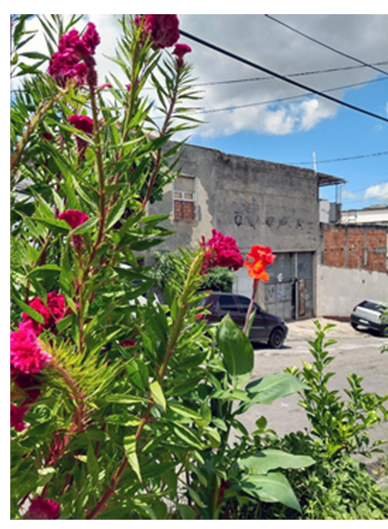
Figures 6 and 7: After the intervention: sidewalk and flowerbeds full of vegetation and care. Source: Authors, 2020.