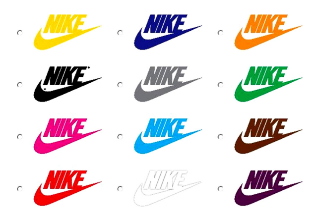
Fig. 1. Brand priming manipulation.

suspicion regarding this first stage's purpose. These two other brands were Sadia and Havaianas. Fig. 1 shows an example of the stimulus for the brand priming manipulation: