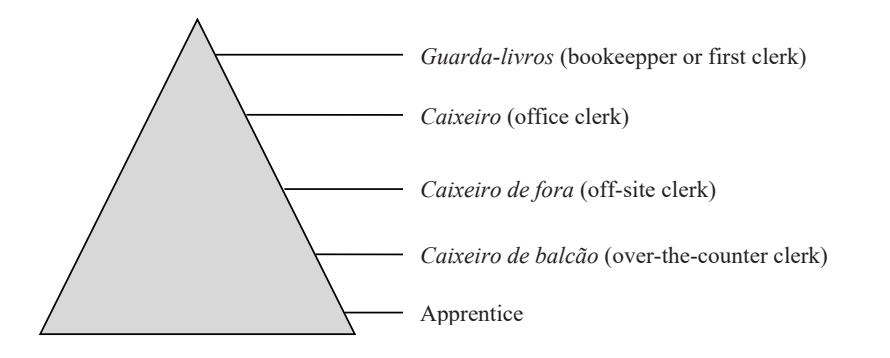
Figure 1 Hierarchy of the accounting practitioners

caixeiro de fora (off-site clerk), caixeiro (office clerk), and, finally, at the top of the pyramid, the position of guarda-livros (bookeepper or first clerk) (Figure 1). As it is possible to observe, the term caixeiro label all positions in the middle of the hierarchy. The difference among them is expressed by adding other terms (i.e., " de fora " or " de balcão ") that have a direct connection with tasks developed at the business. This fact may explain why all accounting practitioners were socially known as caixeiros .