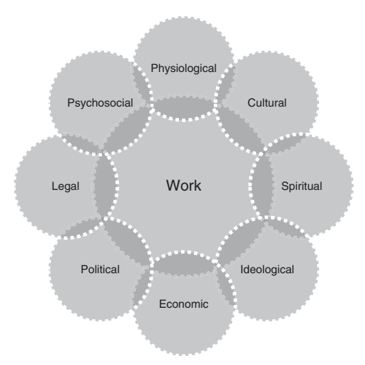
Figure 1. Perspectives of work