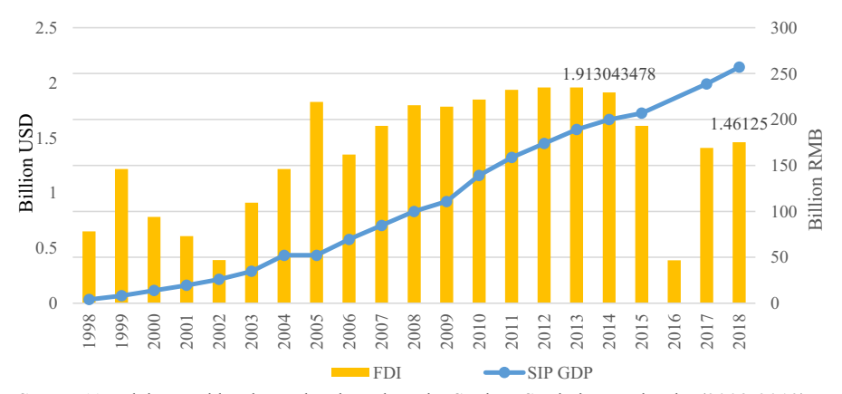
Figure 1. SIP GDP (RMB) and FDI (USD)

To understand the importance of SIP for the economic development of Suzhou Municipality and how it became a reference in China for promoting technological innovation, some data are presented. Figure 1 shows the GDP of the SIP from 2002 starting at 4 Billion RMB to 257 in 2018 (USD 36,7 billion), which constitutes 14% of the Suzhou Municipality GDP in 2018. In the same figure, in yellow are the bars of FDI per year, since 2005 FDI attraction has been