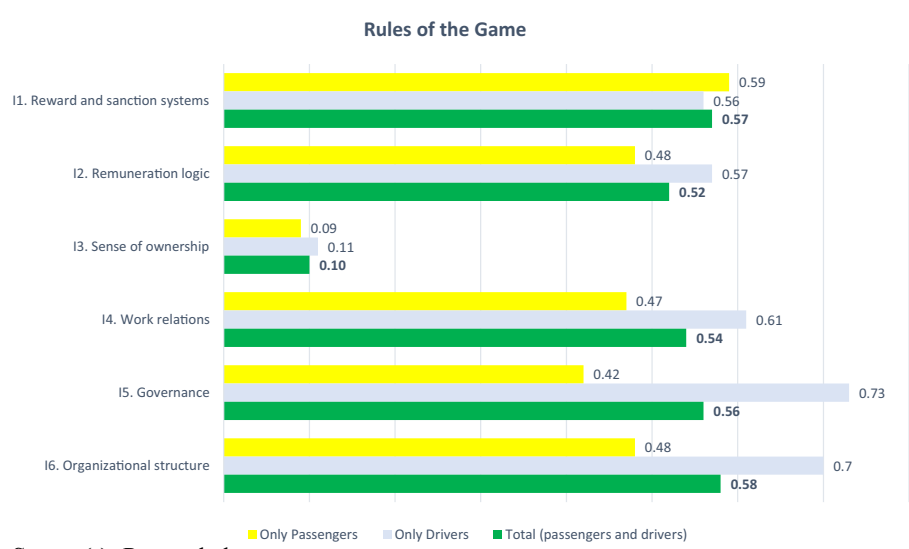
Figure 2. Changes in the perception of institutional environment

Through the equation of the indicator for changes in institutional beliefs, perceptions and preferences, the following values were obtained: 0.48 for the complete sample (drivers and passengers); 0.55 for the sample composed only of drivers and 0.42 for the sample composed only by passengers, which indicates that, on a scale of -1 to 1, the changes in the rules of the game (Laurell & Sandstrom, 2016) promoted by platforms are significant.