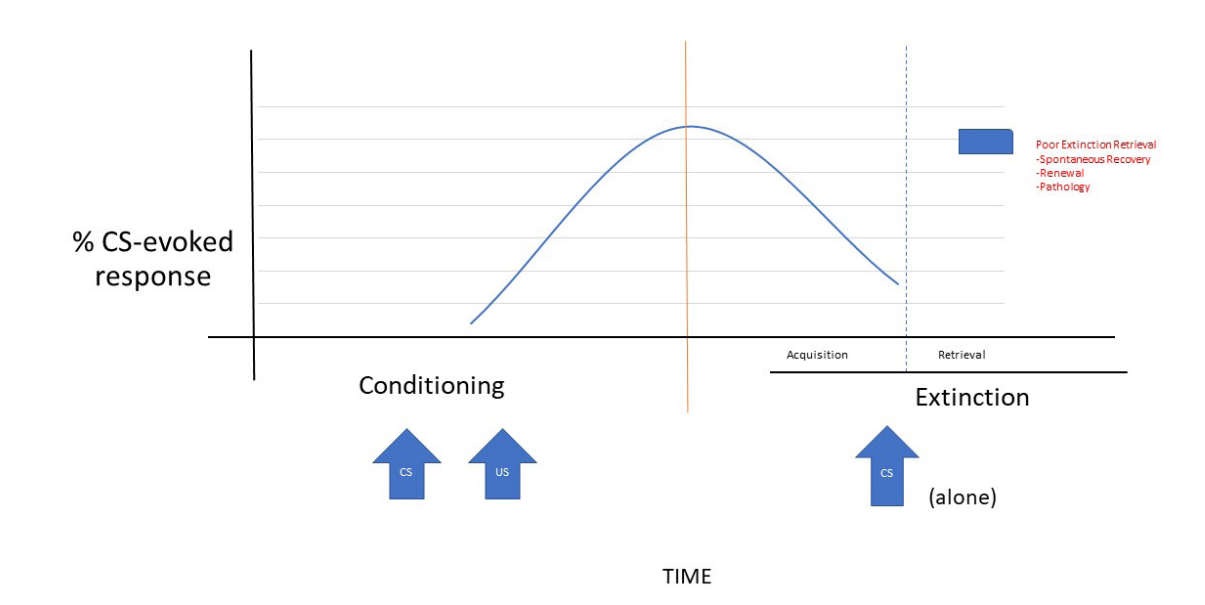
Figure 2. After threat conditioning, extinction training starts with the unpaired presentation of the CS. Extinction retrieval is necessary when the CS reappears after a period of absence (spontaneous recovery) or in a presentation in a different context (renewal). In some disorders, failure to retrieve extinction is a core characteristic of the condition, probably related to hypo-functional vmPFC and hippocampus. Figure adapted from<sup>14</sup>

in that context and occasion. During the initial phases of extinction, sometimes referred to as extinction training, changes similar to long term potentiation, a strengthening of the synapsis connections, appear in those pathways<sup>13</sup>. Then, projections to the amygdala activate glutamatergic intercalated cells, which, in its turn, inhibits de central amygdala, competing with the activation of the basolateral nucleus<sup>14</sup>. Even after extinction is learned, if some time passes without contact with the CS, new presentations of this stimulus may elicit defensive responses again. This phenomenon is known as spontaneous recovery and its occurrence is regulated by the vmPFC, which inhibit amygdala activity through connections between these two structures<sup>7,15</sup>.