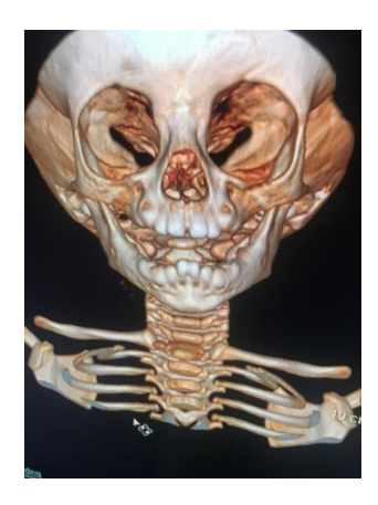
Figure 2: Cranial CT, cervical spine (3D reconstruction)

The neck CT demonstrated total closure of the airway between larynx and trachea at that moment.