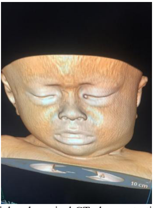
Figure 3 : Cranial and cervical CT demonstrating a cervical mass on the left side.

The set of findings of the clinical history, physical examination and imaging tests corresponded to the diagnosis of fourth branchial cleft cyst.