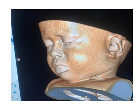
Figure 4: Cranial and cervical CT

irregular fragment of grayish tissue with a soft consistency, measuring 3.0 cm. Cuts were firm, with whitish areas. Microscopic examination showed: thyroglossal cyst, with significant chronic inflammatory infiltrate; granulomatous reaction of the foreign body type; thyroid parenchyma, with interstitial fibrosis; slightly thickened epidermal walls; significant fibrosis of the dermis.