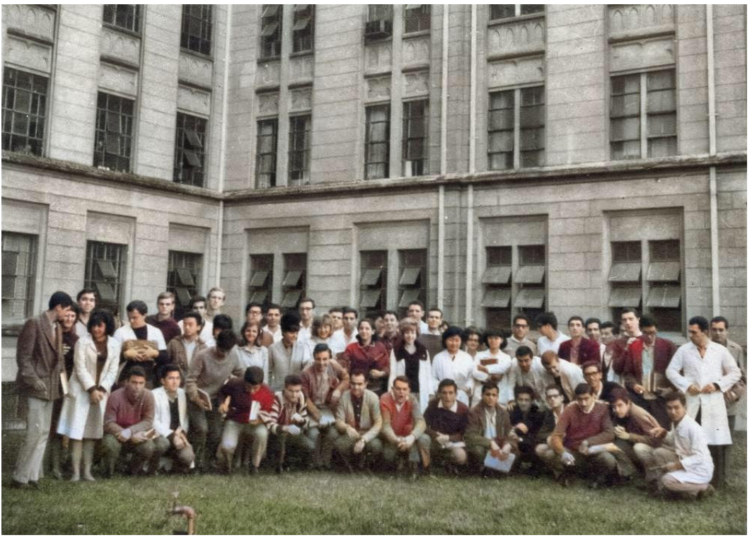
Figure 1. The first photography of all students of the 54th Class.

All the classes that graduated from this or other schools or courses believe, to a greater or lesser extent, that they were unique, that they had very special characteristics. Therefore, I have the right to present some of them, which I think are peculiar to the 54th. class, to which others may be added by you in the next few days when we will be together.