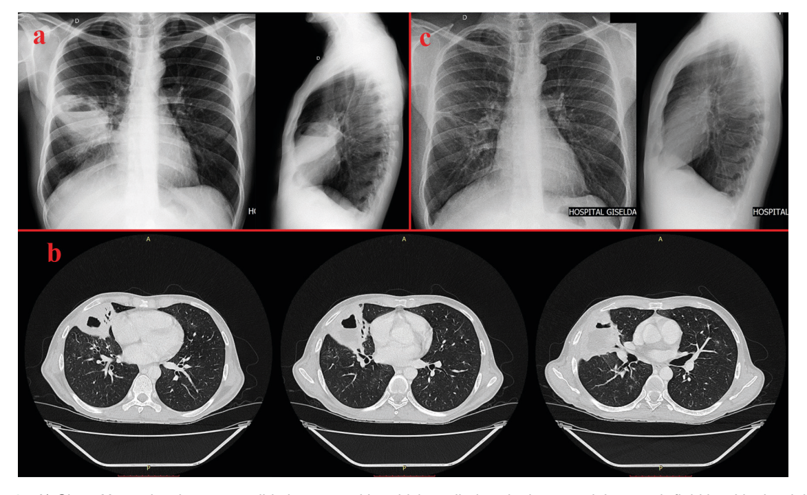
Figure 1 - A) Chest X-ray showing a consolidation area with a thick -walled cavitation containing an air-fluid level in the right mid lung field on the patient's admission; B) Computed tomography showing a pleuropulmonary fluid-gas collection located in the right middle lung lobe; C) Chest X-ray showing linear fibrotic bands with cicatricial appearance in the right mid lung field four months after treatment for Rhodococcus equi pneumonia.

The patient's sputum samples were collected. An acid-fast bacilli smear of the specimen was negative on Ziehl-Neelsen stain, but showed coccobacillary organisms on modified Kinyoun stain (Figure 2A). The GeneXpert MTB/RIF sputum test was negative. Then, the specimen was inoculated on 5% sheep blood agar, chocolate agar and MacConkey's agar plates incubated for 48 h at 37 °C. The sputum sample was also treated by N-acetyl