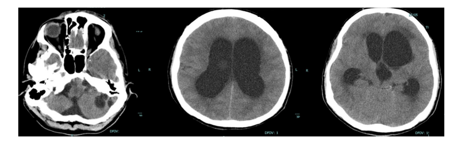
Figure 1 - Head CT. Severe dilation of the ventricular system, involving the third ventricle and lateral ventricles with transependymal edema and a multicystic lesion located in the subarachnoid space at the level of the lateral surface of the left cerebellar hemisphere.