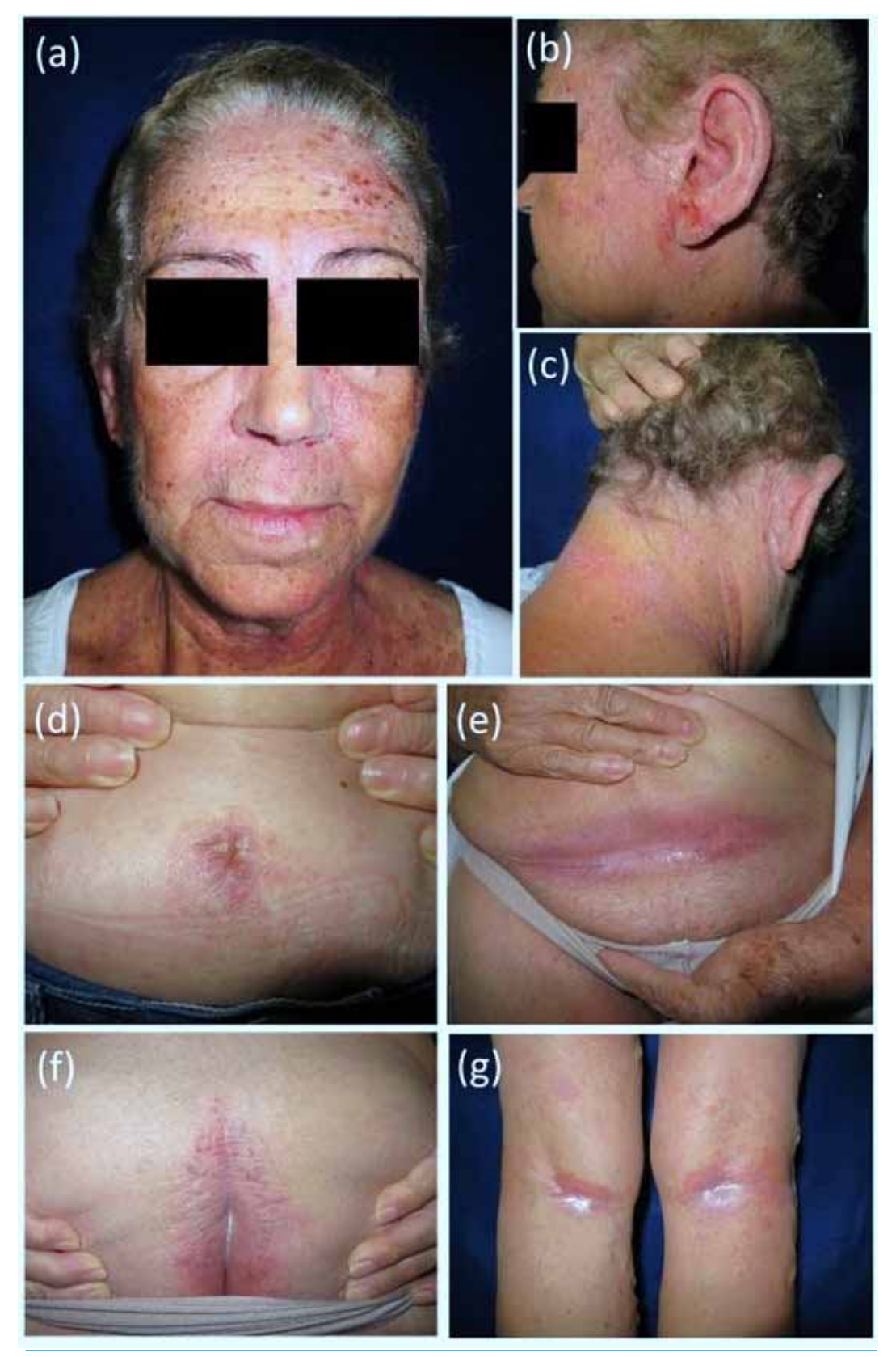
Figure 1: Extensive erythematous, scaly and exudative patches on the face, scalp and neck and flexural areas.