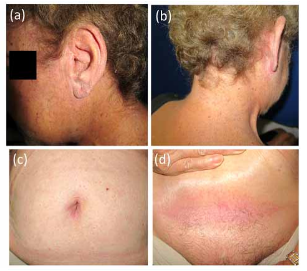
Figure 3: The improvement of the eruption after stopping infliximab.