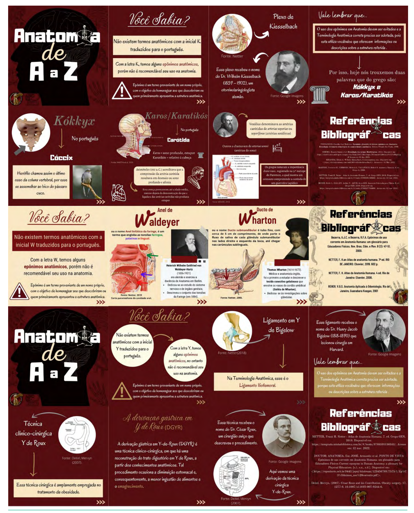
Figure 2: Posts regarding letters K, W, and Y and their correlations with anatomists and surgeons who generated the eponyms.