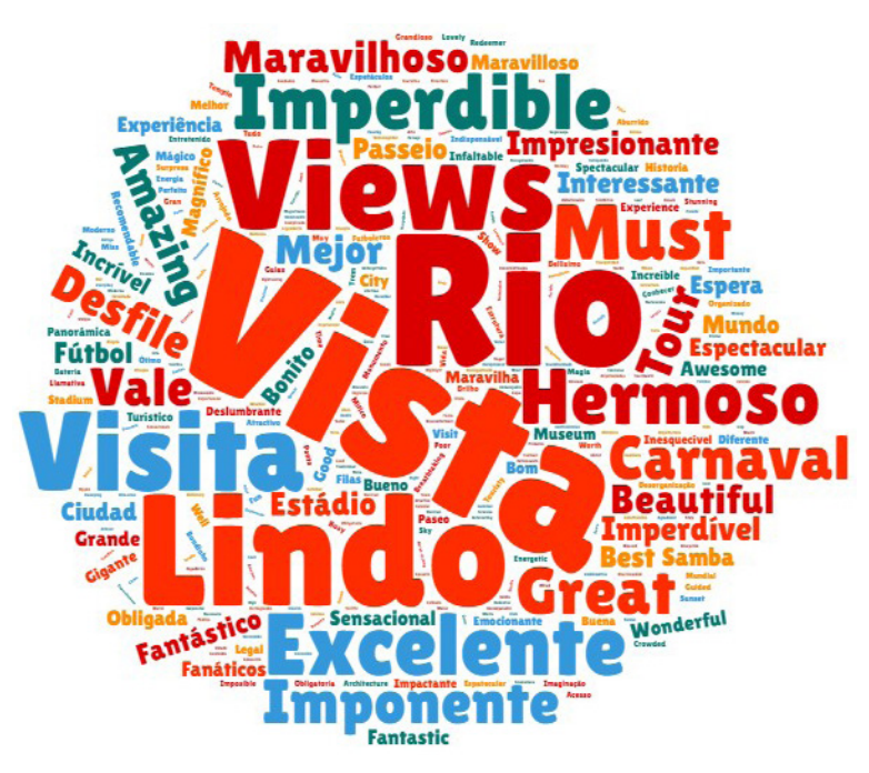
Figure 3 - Wordcloud

An example of a comment's title with this characteristic is "Pão de Açúcar's beautiful view", made by a collaborator level 5 who rated the attraction as a 5. Some titles showed only a single word, without any complement, demonstrating clearly the tourist's opinion about the attraction, such as "Excelente" (Excellent), "Imperdible" (Unmissable), "Maravilhoso" (Wonderful), and "Great". As information and felling sharing is used as the construction of a destination's image (Bosque, Martín, Collado & Salmones, 2009), it is possible to conclude that the titles of TripAdvisor comments concerning the main touristic attractions of the city of Rio de Janeiro constitute the city's image – and that this image is mostly positive.